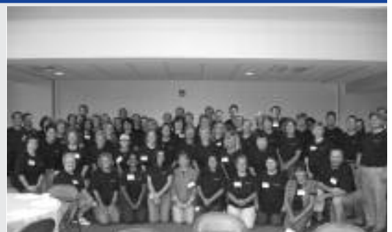
What a wonderful group of volunteers!

We could not have asked for a more dedicated volunteer group and words cannot express how grateful we are to have had them here. Their gift of time, over 310 total hours, and talents are greatly appreciated.