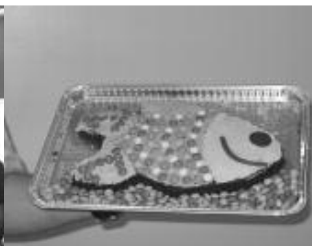
Fish cake decorating contest entry