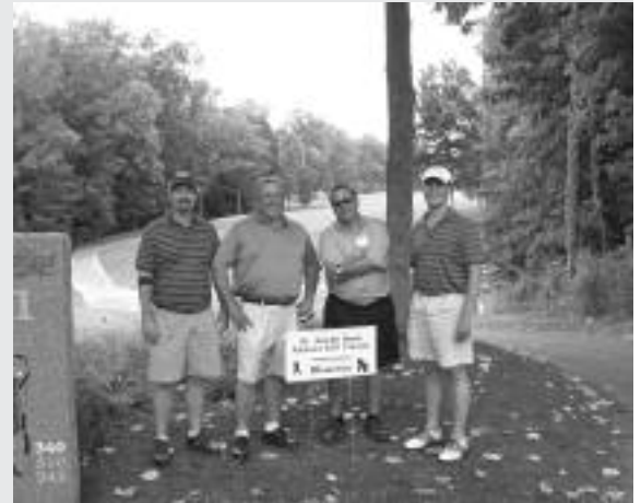
Youtsey Insurance Team - 1st Place

PDT Architects Queen City Printing Sisters of Charity TriHealth Turner Construction Co. USI Midwest Wal-Mart