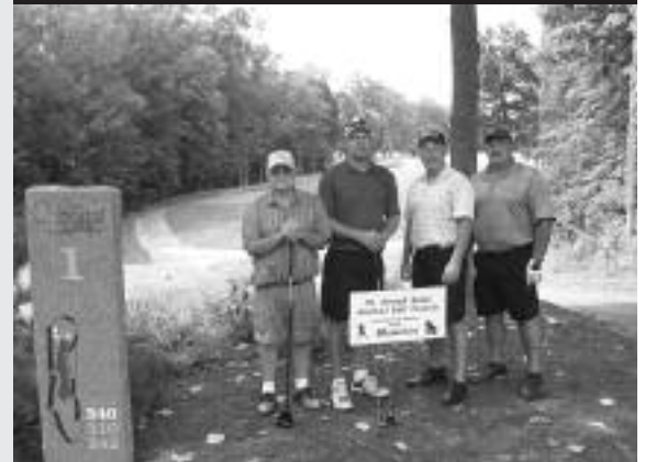
A special thanks to Good Samaritan Hospital of Dayton who upgraded their foursome to a Hole sponsorship this year!

After 20 years the Golf Classic is still going strong. We are looking forward to our 21st Annual Golf Classic on August 3, 2009 and hope you can join us next year.