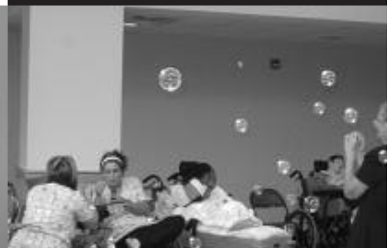
Staff and residents enjoy bubbles!