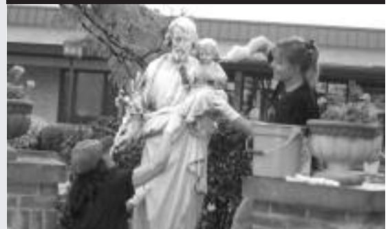
CHI volunteers cleaning the statue of St. Joseph at our entrance